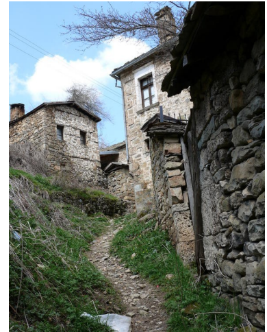
ALBANIAN HILLSIDE VILLAGE